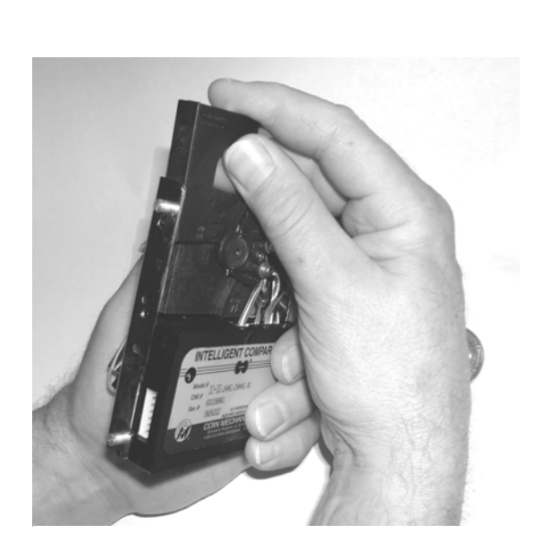
Pull token holder up and free of assembly.