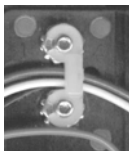
Clip and screws on back

You must unplug the power connector from the Intelligent Comparitor before removing the token holder or Intelligent Comparitor from the channel, otherwise there is a risk of electrical damage to the mechanism or the machine.